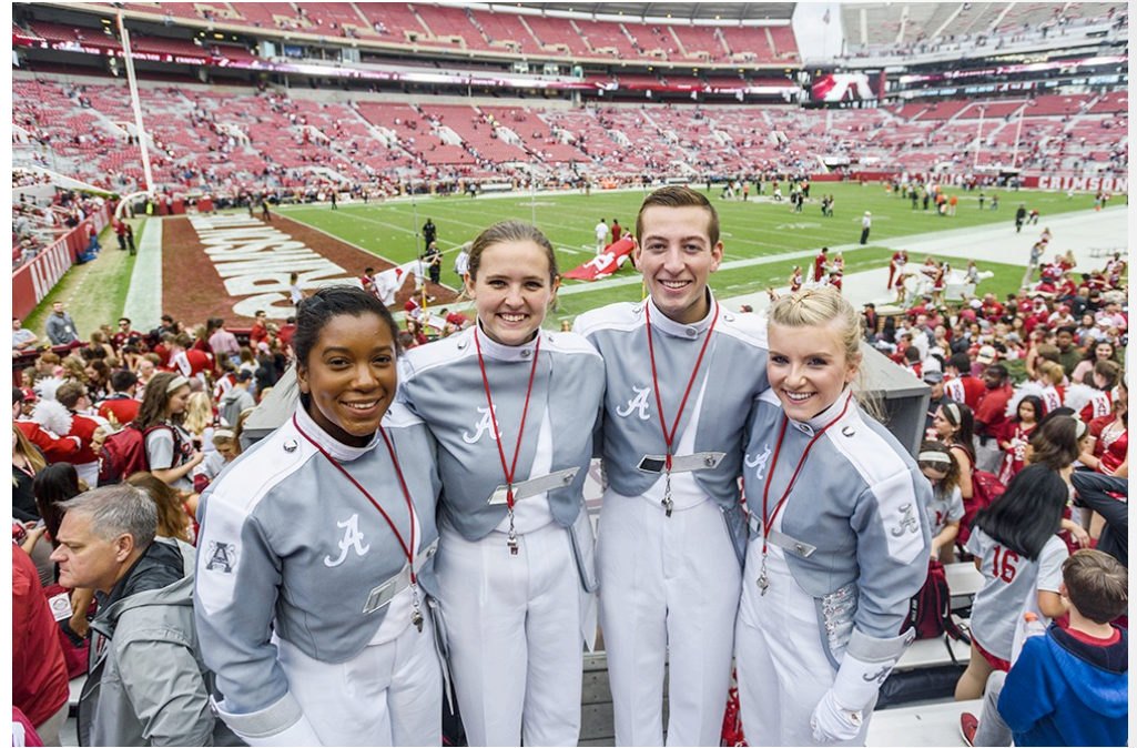
Million Dollar Band to perform in Macy's Thanksgiving Day Parade